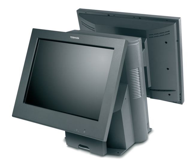
Shown: Independent customer display (12"display) delivers customer information and digital, multi-media merchandising (optional)