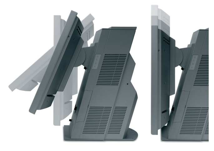
Shown: Infrared touchscreen never needs recalibration and provides a wide range of adjustment options for better viewing, including changing the angle/height of the display and adjusting the touch sensitivity, screen brightness and contrast ratio.