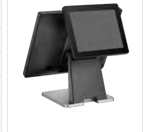
9.7" 2nd display