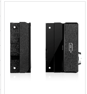
MSR & COMBO