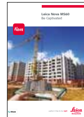
Leica Nova MS60