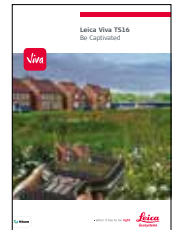
Leica Viva TS16