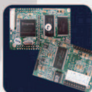
ZEM600 Multi-Media Development Platform