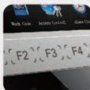
Touchable Function Keypad