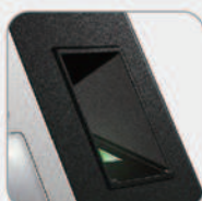
ZK Optical Fingerprint Sensor