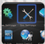
4.3" TFT Touch Screen