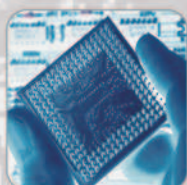
High Speed ZK Multi-Bio CPU