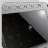
High Resolution Infrared Camera